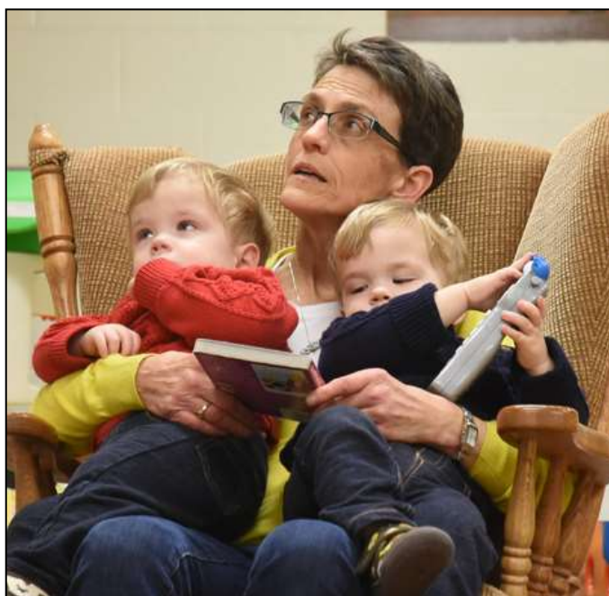
Christmas Eve cuddling ↗

Who's willing to help out? Individuals willing to read books, play games, build towers, cuddle babies during the Sunday school hour – even just once per quarter -- are encouraged to contact Jen at jesommer2000@yahoo.com or 419-230-3945.