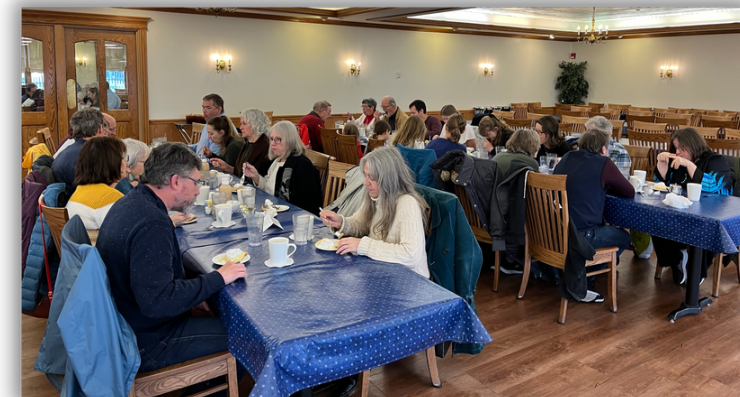
Lunch at the Blue Gate Restaurant