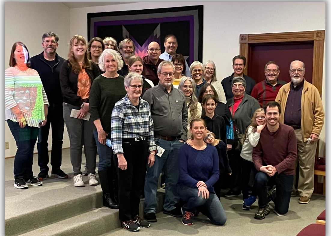
This was the first room on the tour, where we watched an introductory video