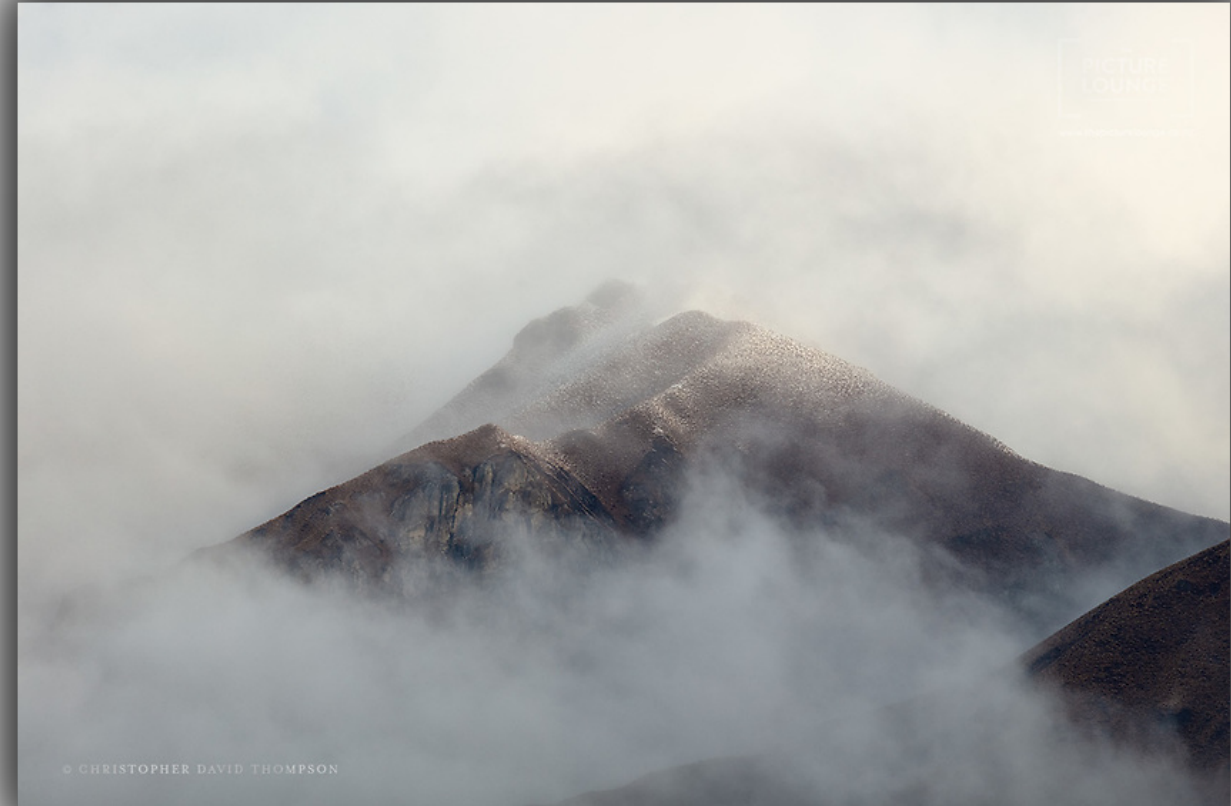
The Mysterious Moment on Mt. Moriah