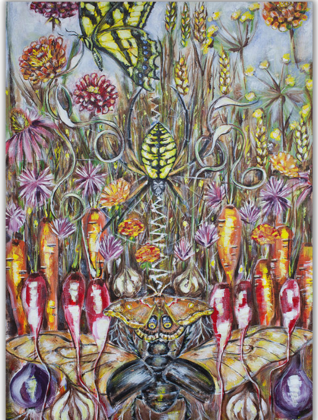
Love.Local.Food. Painting by Susie Huser