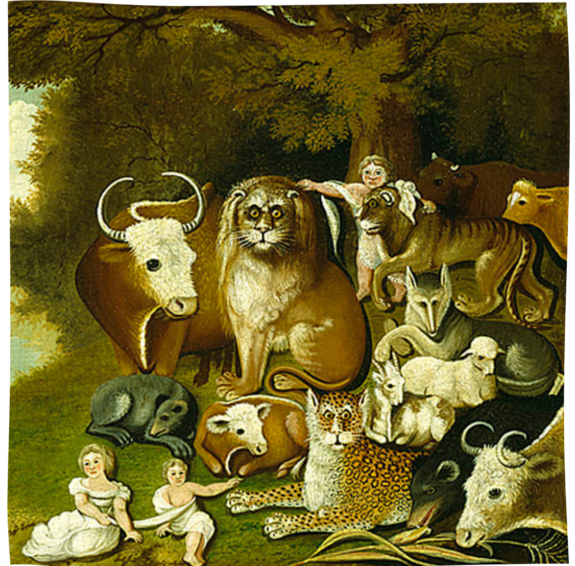
The Peaceable Kingdom